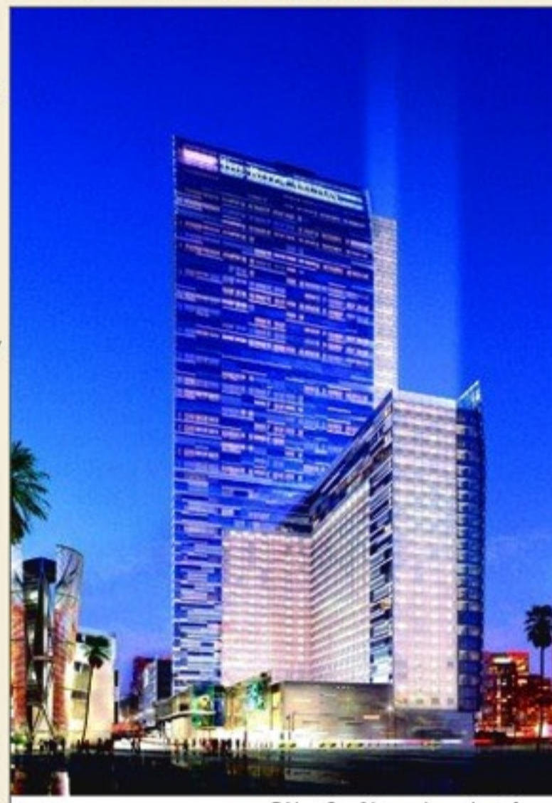
Ritz-Carlton, Los Angeles