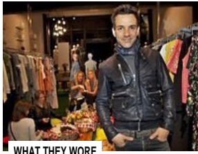
Beckley's In-Store Picnic Featured AstroTurf, Ace Accessories