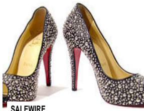
Shop Decades' $150 Shoe Sale Online During Dukes of Melrose